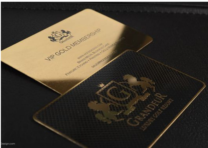
Opalescent Silver Pet 6-7mil/ (reflection will be dull)