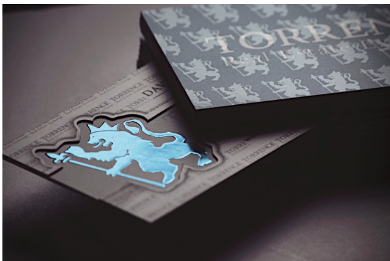
SILK Laminated with Spot Gloss UV Coatings