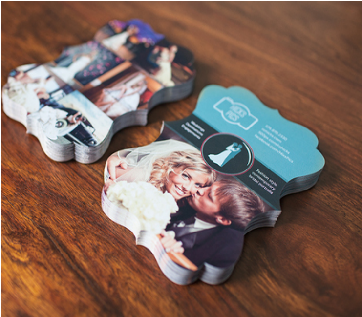
24pt Matte Aqueous Coating (30% PCW)