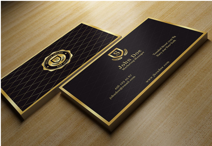
18pt C2S Stock with Soft Touch Coating