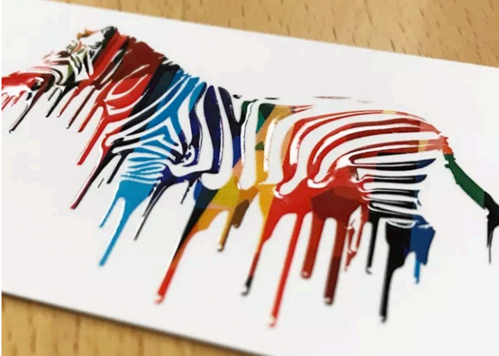
120 # Dull/ Matte24P Cover with Raised Spot UV

Thick Suede Business Card with Embossing, Die Cut, Silver Foil and Red Colored Edges.