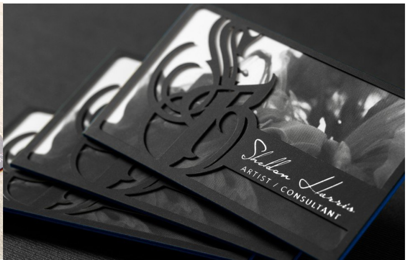
Thick Suede Business Card with Embossing + Debossing, Die Cut, Silver-Gold Foil Stamp and Colored Edges