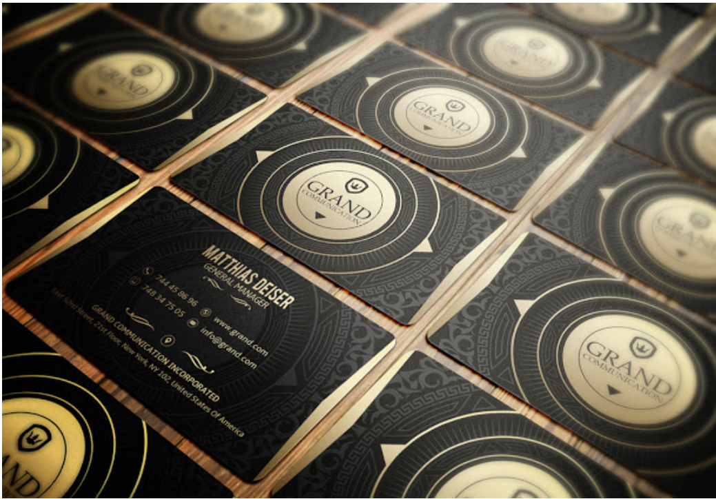
Silk lamination 24Pt with Spot UV Business Cards (Blind Press embossing and a Hole punch)