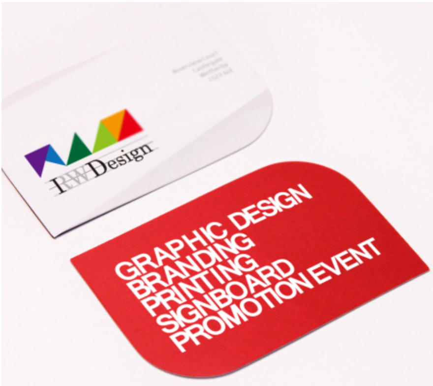
Soft Touch Coating + 2 rounded corners of 25'' (one on the right superior corner and other in the left inferior side)