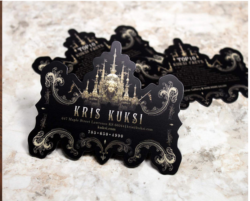
Soft Touch Coating + Foil Gold Stamp