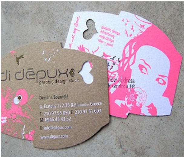
Glossy Gold Foiling & Silk Laminated cards with Die Cut Shape and Laser Cutting