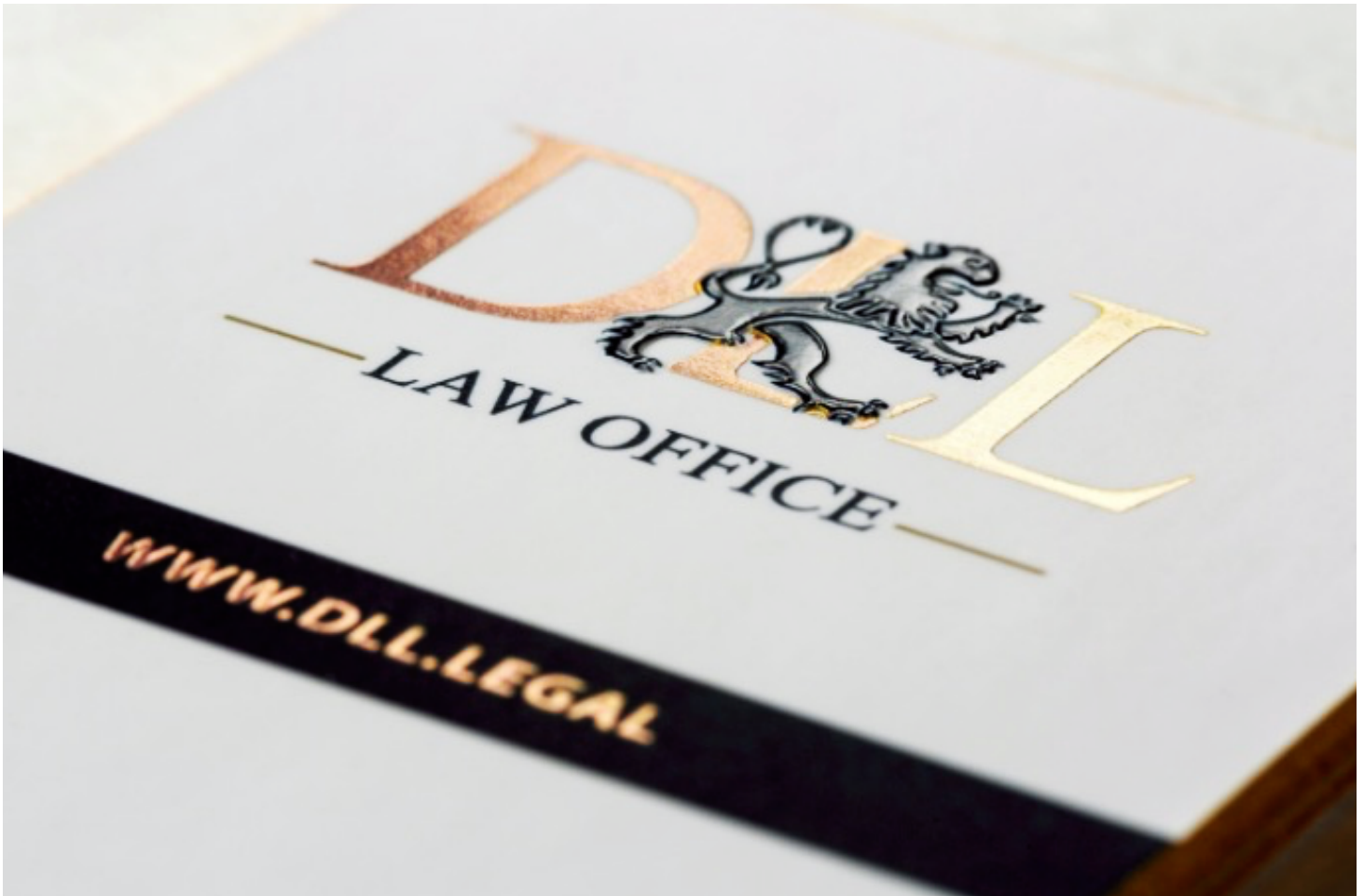
Ultra thick suede business cards with Copper Foil + Ink Press Embossing, Spot UV and Copper Colored Edges (Three-dimensional cards adding design options such as Color Edging and Embossing + Debossing)