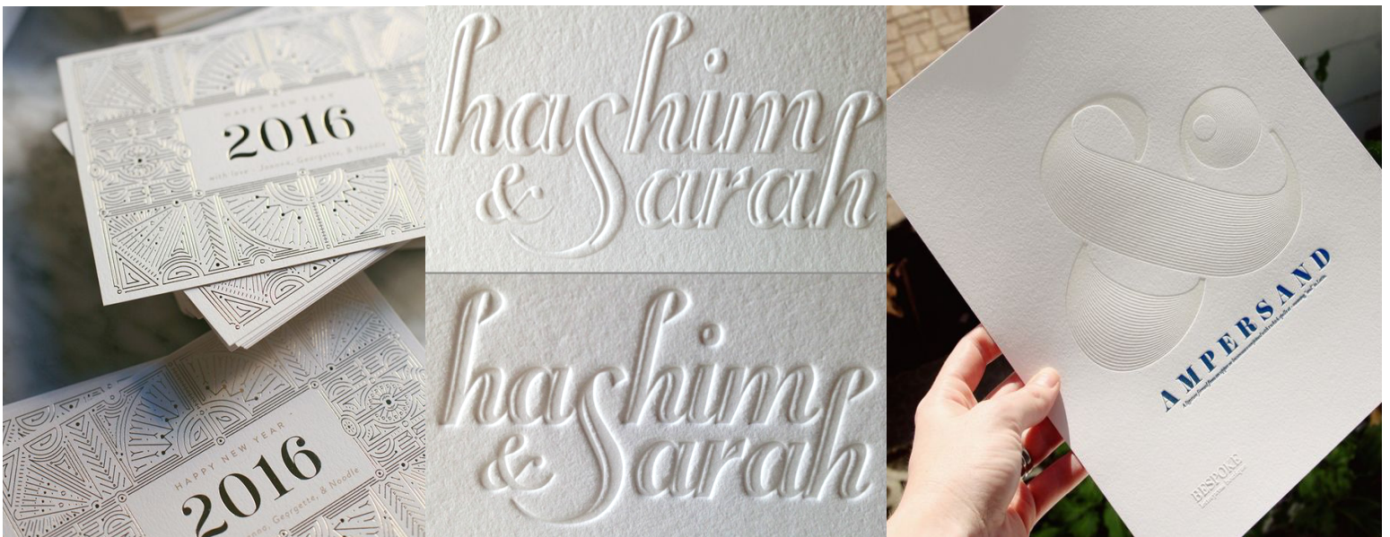
Embossed & Debossed Business Cards with Sumo Nouveau, 16 PT & 32PT Variations of thickness